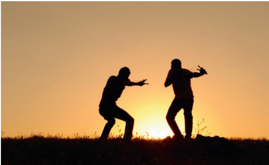
Fikret Atay, from: Saints of the City , 2012.

The Bureau of Melodramatic Research and Postspectacle have collaborated on several occasions (selection): Bezna Congress performance-in-the-dark series , CNDB, Bucharest (2013); End Pit , DEPO, Istanbul (2013); The Postspectacle Shelter, House of the People , MNAC, Bucharest (2012).