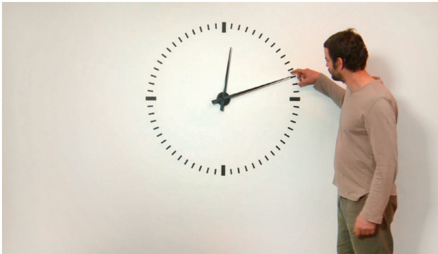
Ivan Moudov, from: Performing Time , 2012

Ivan Moudov lives in Sofia. Exhibitions (selection): Museum of Modern and Contemporary Art Casa Cavazzini, Udine (2013); Beziehungsarbeit , Künstlerhaus Vienna (2011); Monument to Transformation , City Gallery, Prague (2009).